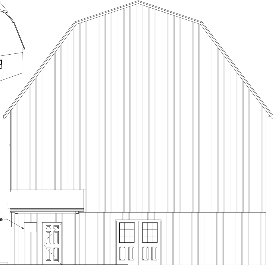
ELEVATION SCALE: 1/4" = 1'-0"

DCNR GRANT SIGN SIGNS AT MIN. 60" OFF GRADE AS PER ICC/ANSI A117.1-2003 SEC. 502.1