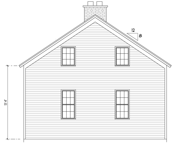
WEST ELEVATION SCALE: 1/4" = 1'-0"